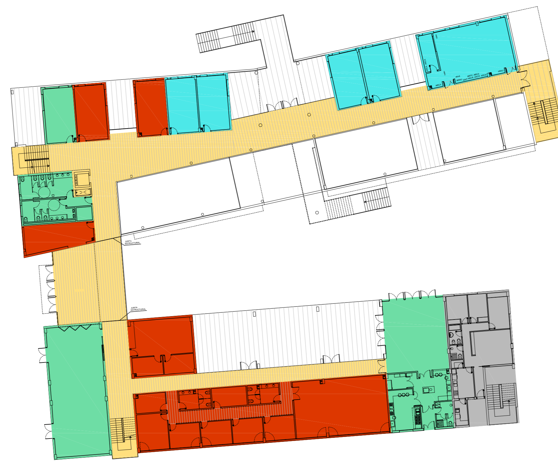
planta cota +0.00