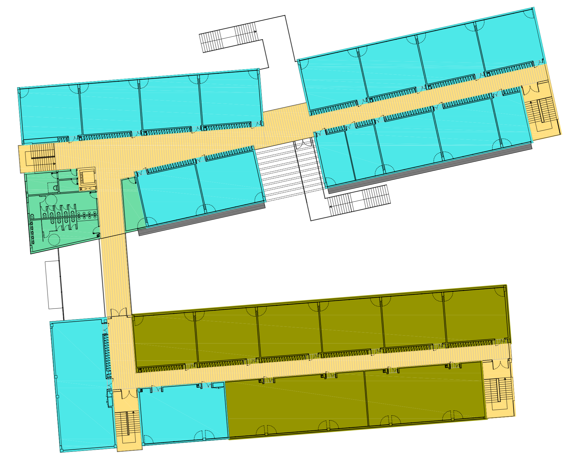
planta cota +3.90