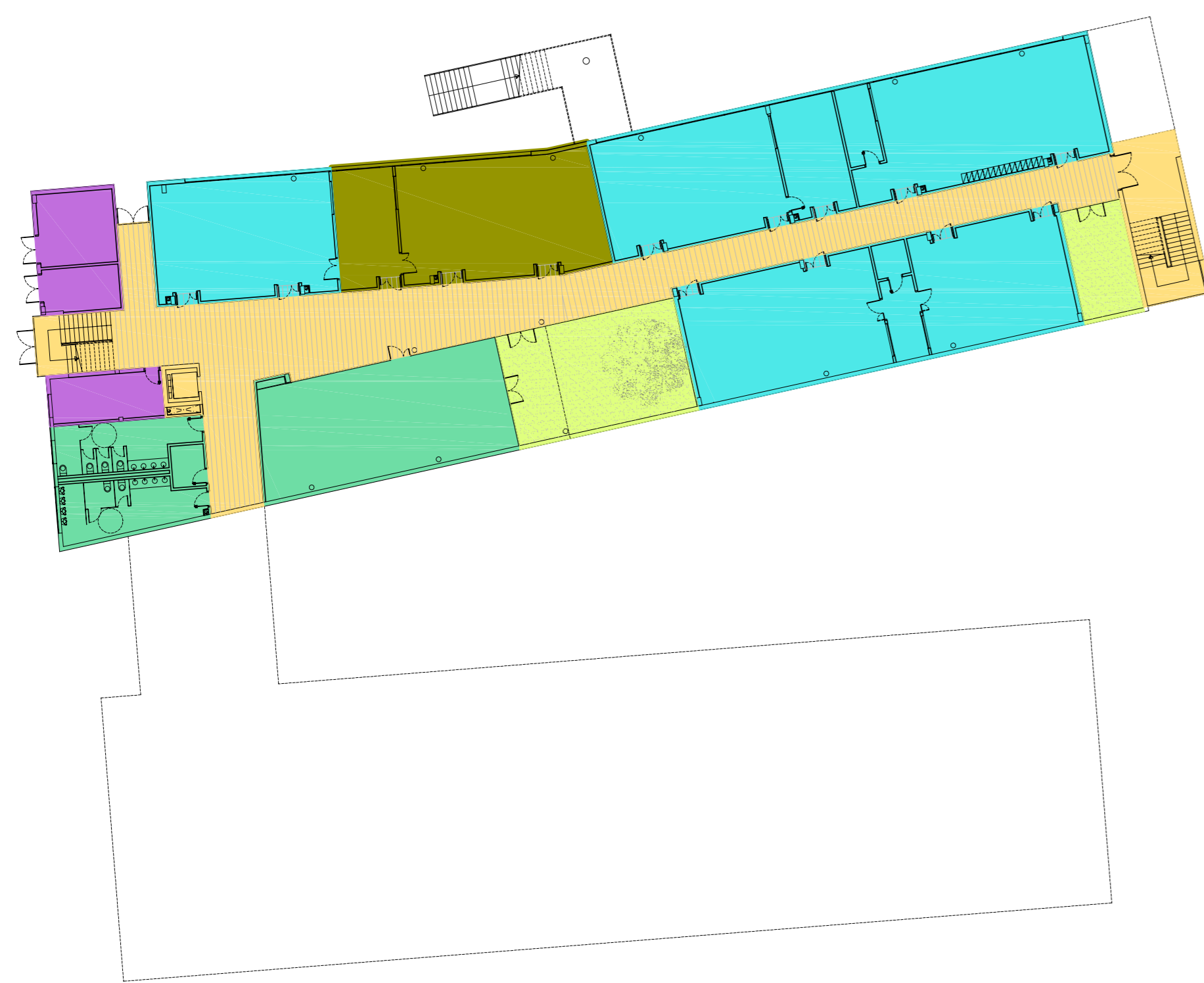
planta cota -3.90